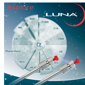
Products used in this application: