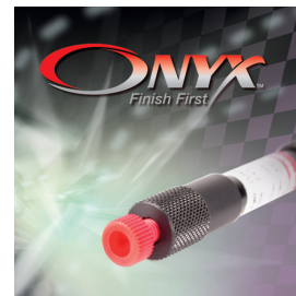
Products used in this application: