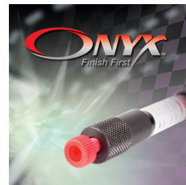
Products used in this application:

Analyst Note: 2 columns coupled end to end 15593