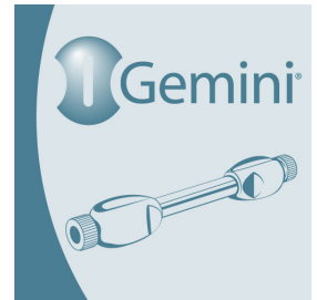
Products used in this application: