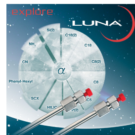
Products used in this application: