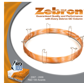
Products used in this application:

Column: Zebtron™ ZB-5MSi, GC Cap. Column 30 m x 0.25 mm x 0.25 μm, Ea Phase: 5% Phenyl 95% Dimethylpolysiloxane Dimensions: 30 meters x 0.25 mm x 0.25 μm Order No: 7HG-G018-11 Oven Profile: 40 °C for 1 min to 100 °C @ 15 °C/min to 225 °C @ 5 °C/min to 320 °C @ 15 °C/min for 5 min Carrier Gas: Constant Flow Helium, 0.8 mL/min Injection: On-Column :1 0.5 μL @ 43°C Detection: Mass Selective (MSD) (335°C) Analyst Note: Analytes 10 ppm in Acetone