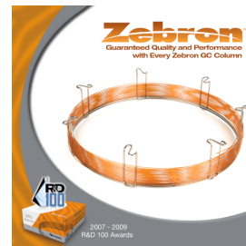
Products used in this application:

Column: Zebtron™ ZB-35, GC Cap. Column 30 m x 0.25 mm x 0.25 µm, Ea Phase: 35% Phenyl 65% Dimethylpolysiloxane Dimensions: 30 meters x 0.25 mm x 0.25 µm Order No: 7HG-G003-11 Oven Profile: 40 °C for 1 min to 100 °C @ 15 °C/min to 225 °C @ 5 °C/min to 320 °C @ 15 °C/min for 5 min Carrier Gas: Constant Flow Helium, 0.8 mL/min Injection: On-Column :1 0.5 µL @ 43°C Detection: Mass Selective (MSD) (335°C) Analyst Note: Analytes 10 ppm in Acetone