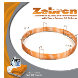
Products used in this application:

Column: Zebtron™ ZB-1701, GC Cap. Column 30 m x 0.25 mm x 0.25 μm, Ea Phase: 14% Cyanopropylphenyl 86% Dimethylpolysiloxane Dimensions: 30 meters x 0.25 mm x 0.25 μm Order No: 7HG-G006-11 Oven Profile: 40 °C for 1 min to 100 °C @ 15 °C/min to 225 °C @ 5 °C/min to 290 °C @ 15 °C/min for 25 min Carrier Gas: Constant Flow Helium, 0.8 mL/min Injection: On-Column :1 0.5 μL @ 43°C Detection: Mass Selective (MSD) (335°C) Analyst Note: Analytes 10 ppm in Acetone