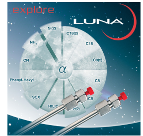
Products used in this application: