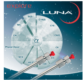
Products used in this application: