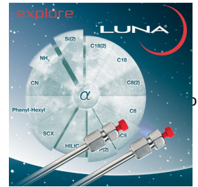
Products used in this application:

Column: Luna® Omega 5 µm C18 100 Å, LC Column 150 x 4.6 mm, Ea Dimensions: 150 x 4.6 mm ID Order No: 00F-4785-E0 Elution Type: Isocratic Eluent A: Buffer (dilute 7 mL of triethylamine with water to 1 L. Stir and adjust with Gradient Step No. Time (min) Pct A 1 20 100 Profile: Flow Rate: 1.4 mL/min Col. Temp.: 30 °C Detection: LC/UV (DAD, PDA) @ 290.000000000 nm (nanometers) (30 °C) Analyst Note: 0.028 mg/mL