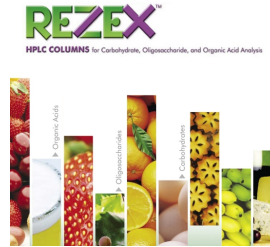
Products used in this application: